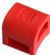
Mounting holder "Bike" for SIAC

SPORTident also offers mounting equipment for MTBO.